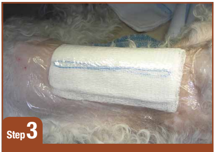
Gently smooth down the dressing, helping to seal the film. Remove the top liner.