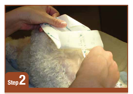
Remove the backliner. Hold dressing by side tabs. Center over dressing or area requiring fixation or protection and apply without stretching.