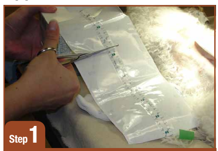
Cut to desired length and round corners or cut to shape for given application.